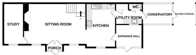
GROUND FLOOR 850 sq.ft. (79.0 sq.m.) approx.