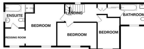
1ST FLOOR 644 sq.ft. (59.8 sq.m.) approx.